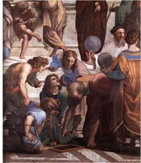
Euclid in Raphael's School of Athens