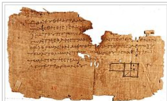
One of the oldest surviving fragments of Euclid's Elements , found at Oxyrhynchus and dated to circa AD 100 (P. Oxy. 29). The diagram accompanies Book II, Proposition 5. [12]